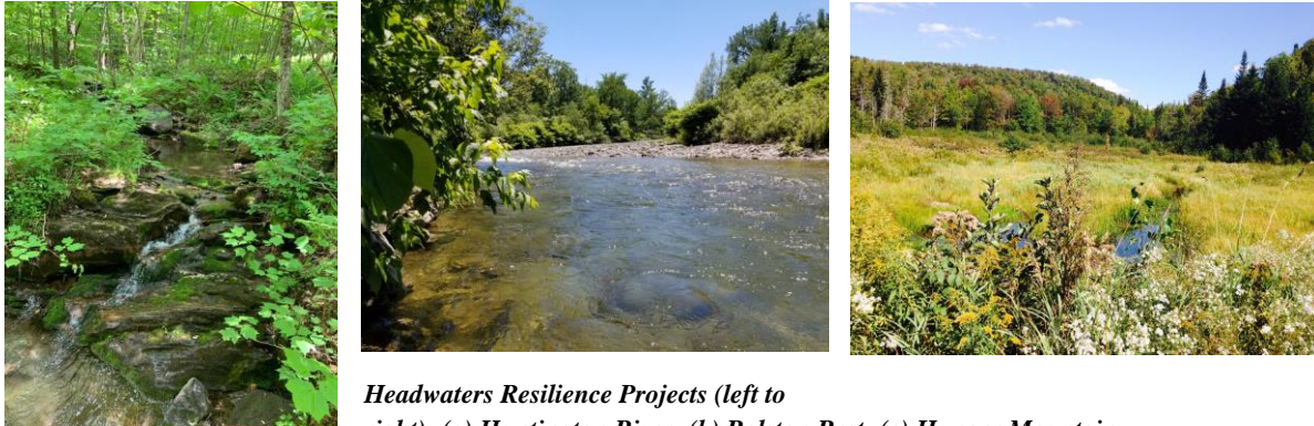
Headwaters Resilience Projects (left to right): (a) Huntington River; (b) Rolston Rest; (c) Hunger Mountain